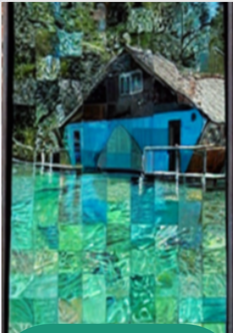
Mural in downtown Klamath Falls painted by CTC patients.